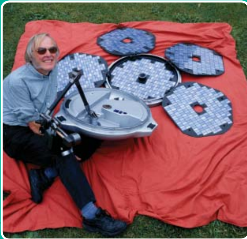
Colin Pillinger – Leader of the Beagle Mission to Mars