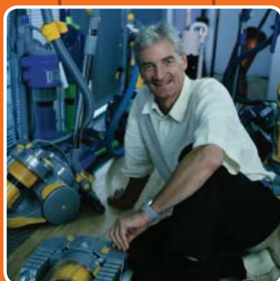
James Dyson – Design Engineering