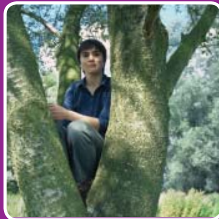
Dr Ottoline Leyser – Botany

'Jacanas trotting across lily pads in southern India, cuckoos calling in AUSTRALIAN EUCALYPTUS SCRUB – these are what inspire me.'