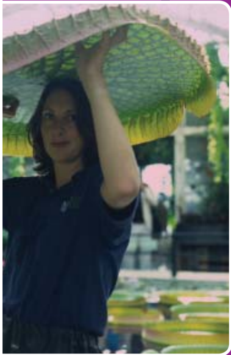
Culture of Tropical Plants at Kew Gardens