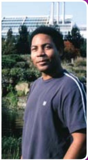
Horticulture of Medicinal Plants at Kew Gardens